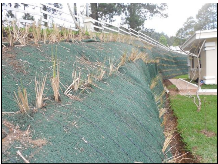
Photo 12: Protection of a slope at a prívate residence. Carchá, April 2013.