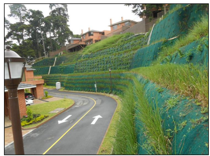
Photo 11: Slopes protected with geomats and the vetiver system. Concepción, June 2013